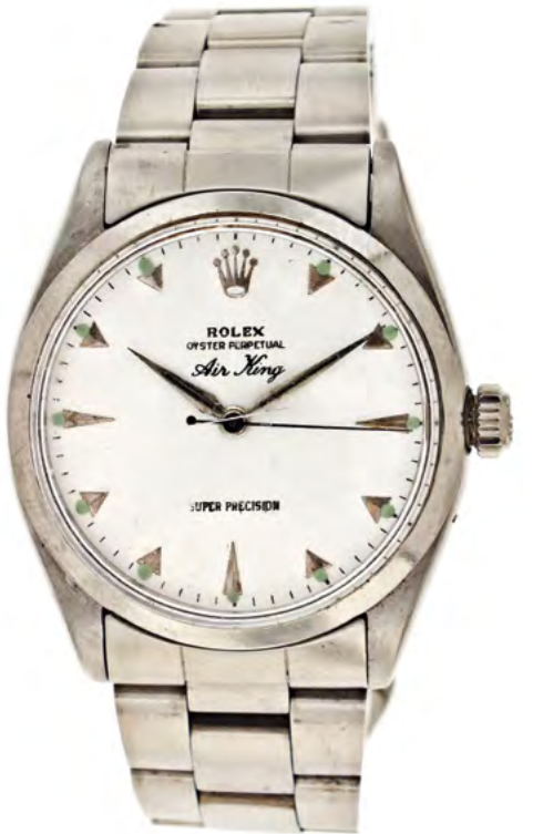
315 Rolex Watch Co., Switzerland, a mid 20th century ref. 5500 “Air King” wrist watch, 25 jewels, automatic winding, rhodium plated movement with lever escapement and monometallic balance, in a stainless steel Oyster case and ref. 78350 Oyster bracelet with 571 ends, white painted dial with triangular markers and alpha hands, serial #369164 (case), 50069 (movement), 34mm $1500-$2000 Circa late 1950s