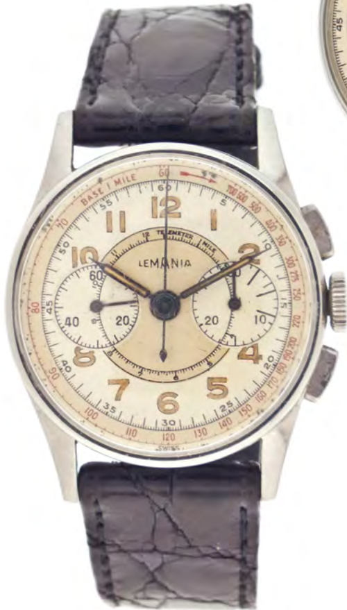
311 Lemania, Switzerland, a mid 20th century wrist chronograph, 17 jewels, manual winding, rhodium plated cal. CH27 movement with lever escapement in a round, stainless steel case with crocodile strap, arabic numeral two tone dial with 30 minute register at 3:00, constant seconds at 9:00, and blued steel hands, movement serial #13852, case #10667, 32mm $3000-$4000 Circa 1945