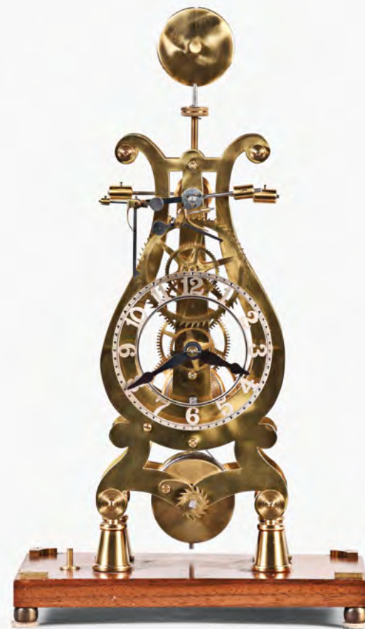
263 A 20th century lyre plate skeleton clock with grasshopper escapement based on a design published by W.R. Smith, the fusee timepiece movement with large escape wheels, counterpoised pallets, compound pendulum, skeletonized arabic numeral silvered dial, and thick, well made lyre form plates with conical frustum feet, on a wooden base with conforming rectangular acrylic cover

$2500-$3500 Circa 1865 21.5in x 12.75in x 4in