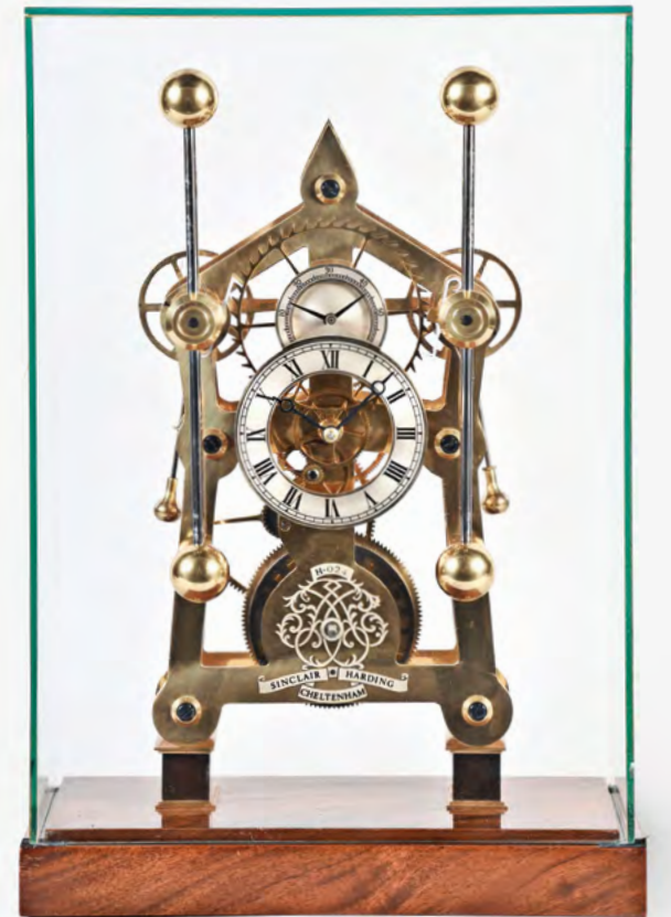
264 Sinclair Harding, Cheltenham, a skeletonized "John Harrison Sea Clock", the polished brass timepiece movement with large escape wheel and dual compound pendulums, each carrying a counterpoised pallet, roman numeral silvered dial with separate seconds bit above 12:00, the lower part of the front plate with a Sinclair Harding badge, and scroll ornament below a reserve engraved with the serial #H- 024, the frame resting on rectangular plinths and mounted to a rectangular wooden base with conforming glass cover

$1000-$1500 Circa late 20th c 20.5in x 11in x 7in