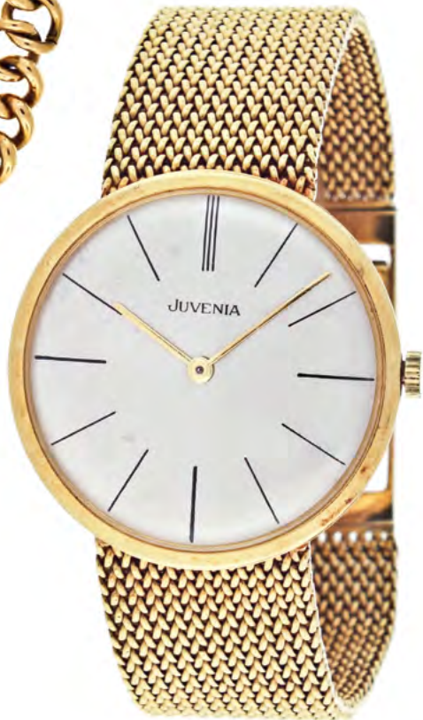
314 Juvenia, Switzerland, a mid 20th century gold wrist watch, 21 jewels, manual winding, rhodium plated cal. 604 movement with lever escapement in a round, 18 karat yellow gold case with integral mesh bracelet, and stick marker silver dial with gold stick hands, 33.5mm, 65.8g TW $1500-$2000 Circa mid 20th c