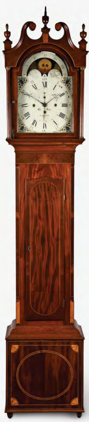
259 Samuel Hill, Harrisburg, Pennsylvania, an early 19th century tall clock, mahogany veneered Federal style case with inlay and figured fields, the bonnet with broken arch top, wooden finials, and turned columns, the trunk with chamfered corners, checkered inlay, and door with oval stringing surrounding a figured mahogany field, and the base with quarter fans, stringing, and circular, cross banded inlay, all resting on turned feet, arched, 14 inch roman numeral white painted iron Osborne dial signed "S. Hill Harrisburg" displaying phases of the moon, center sweep calendar and conventional seconds bit below 12:00, beautifully fretted and finished blued steel hands, and 8 day, three train, weight driven movement with bell signed "G. Ainsworth"

$3000-$5000 Circa 1910 101in x 25in x 12.5in