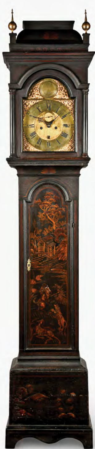
260 Henton Brown, London, a mid 18th century tall clock, the japanned oak case with caddy top, two brass ball and spire finials, and break arch trunk door, all resting on a bracket base, arched 12 inch composite brass dial with engraved roman numeral chapter ring, seconds bit and calendar aperture, cast brass spandrels and maker's name engraved on a silvered boss, 8 day, time and strike weight driven movement

$1400-$1800 Circa 1805 102in x 20.5in x 10.5in