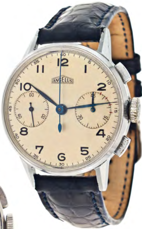
312 Angelus, Switzerland, a mid 20th century Angelus “Big Eyes” wrist chronograph, the 17 jewels, manual winding, rhodium plated movement with lever escapement in a stainless steel case with alligator strap, arabic numeral, double sunk metal dial with 45 minute register at 3:00, constant seconds at 9:00, and blued steel leaf hands, serial #254630, 36mm $2000-$3000 Circa 1950