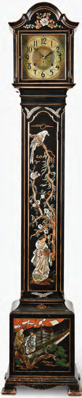
261 Seth Thomas Clock Co., Thomaston, Conn., a rare Grandmother Sonora model in a japanned case with raised ornamentation on an ebonized background, arabic numeral brass dial, 8 day, three train, spring driven movement striking the quarter hours on four Sonora bells on separate movement

$1200-$1600 Circa 1750 97in x 19.25in x 9.5in