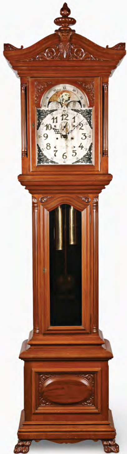
258 E. Howard & Co., Boston, Mass., tall clock in a carved mahogany case with large upper center finial, beveled glass trunk door resting on base with oval set panel and carved surround and paw feet, composite silvered brass dial, serpentine hands, and 8 day, time and strike weight driven brass movement drive by two brass weights

$3000-$5000 Circa 1910 101in x 25in x 12.5in