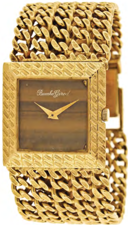
310 Bueche Girod, Switzerland, an 18 karat gold ref. 9828 wrist watch, 17 jewels, manual winding, adjusted to four positions, rhodium plated Frederic Piguet cal. 21 movement with lever escapement in an 18 karat yellow gold square case with integral curb link mesh bracelet, markerless tiger eye dial with gold dauphine hands, serial #60694, 74.6g TW $2000-$2400 Circa 1980