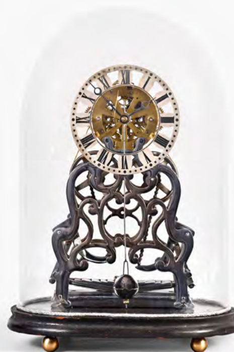
265 Atkins, Whiting & Co., Bristol, Conn., a 30 day clock movement with Ives wagon spring motive power and roller pinions, nickel plated cast iron type III frame with brass, 30 day timepiece movement, skeletonized, roman numeral silvered dial with blued steel hands, on an ebonized oval base with brass ball feet and conforming dome

$1000-$1500 Circa 1985 18.25in x 12.5in x 8.25in