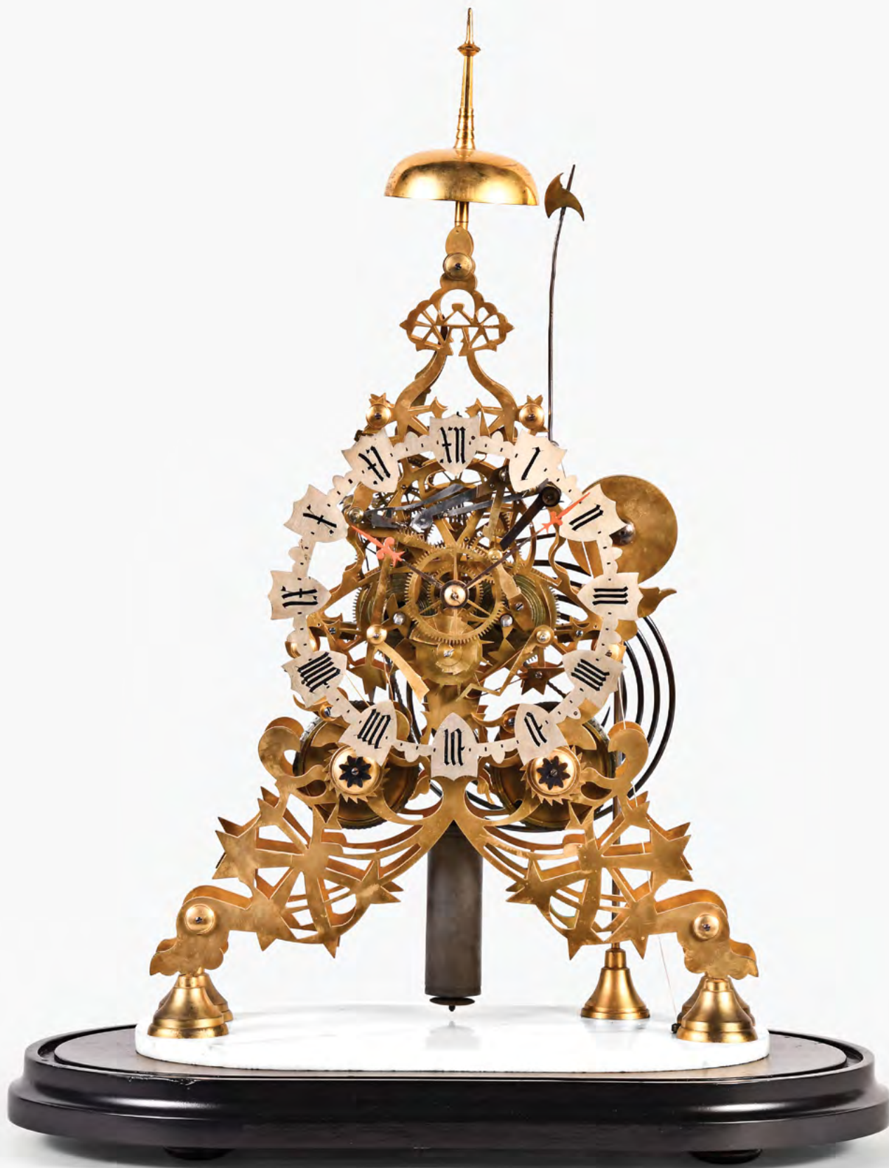
262 Attributed to Evans, Handsworth, an unusual, large mid 19th century skeleton clock, the gilt, intricately fretted frames incorporating unconventional curves, angular and star form ornament, resting on bell form feet, and surmounted by a bell and spire, gothic roman numeral silvered dial with shield shaped reserves, blued steel fleur de lis hands, and 8 day, two train fusee movement with recoil escapement, striking the hours on a large gong, with passing half hour strike on a bell, the wheels with fine six spoke crossings, and Evans type compensated half seconds pendulum with wooden rod and cylindrical pewter bob, now mounted to an oval wooden base with white marble platform, with large, rectangular Lexan cover, dimensions listed are of the clock only, excluding the base and dome

$2500-$3500 Circa 1865 21.5in x 12.75in x 4in