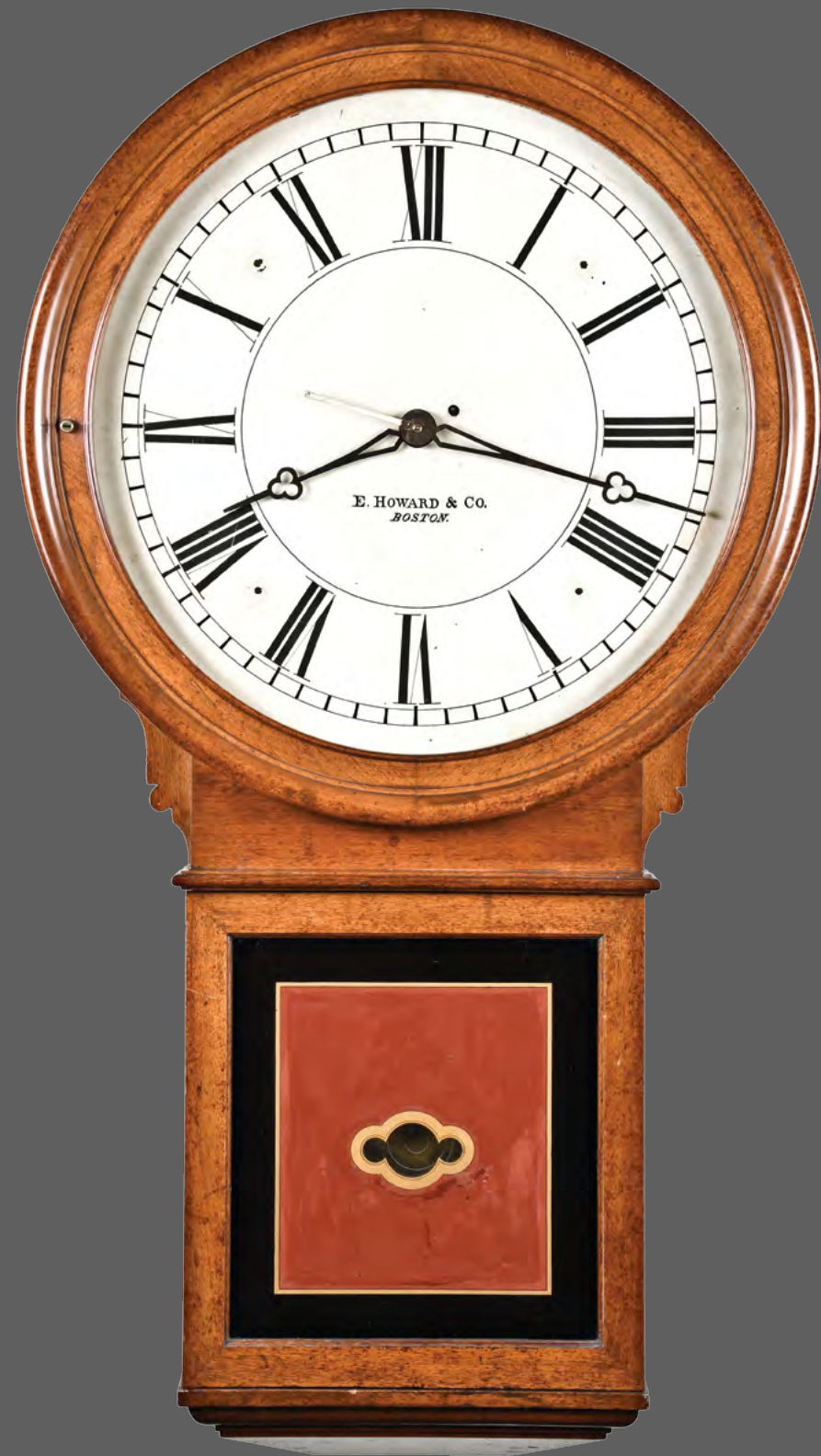
229 E. Howard & Co., Boston, Mass., "No. 70-24 Regulator" hanging clock with walnut case, rare 24 inch painted metal dial, trefoil hands, and 8 day, weight driven brass movement. $10000-$15000 Circa 1900 58.25in x 29.5in x 5.75in