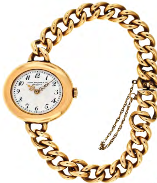
313 Patek, Philippe & Cie., Geneva, an early 20th century lady's gold wrist watch with curb link bracelet, 10 ligne, 18 jewels, manual winding, cotes de Geneve decorated bar movement with lever escapement, cut bimetallic balance and wolf tooth winding in an round, 18 karat yellow gold case, now with a 14 karat curb link bracelet, arabic numeral white enamel dial with gilt Louis XV hands, serial #113311, 26.5mm, 49.3g TW, case, dial and movement signed $1600-$2200 Circa 1900