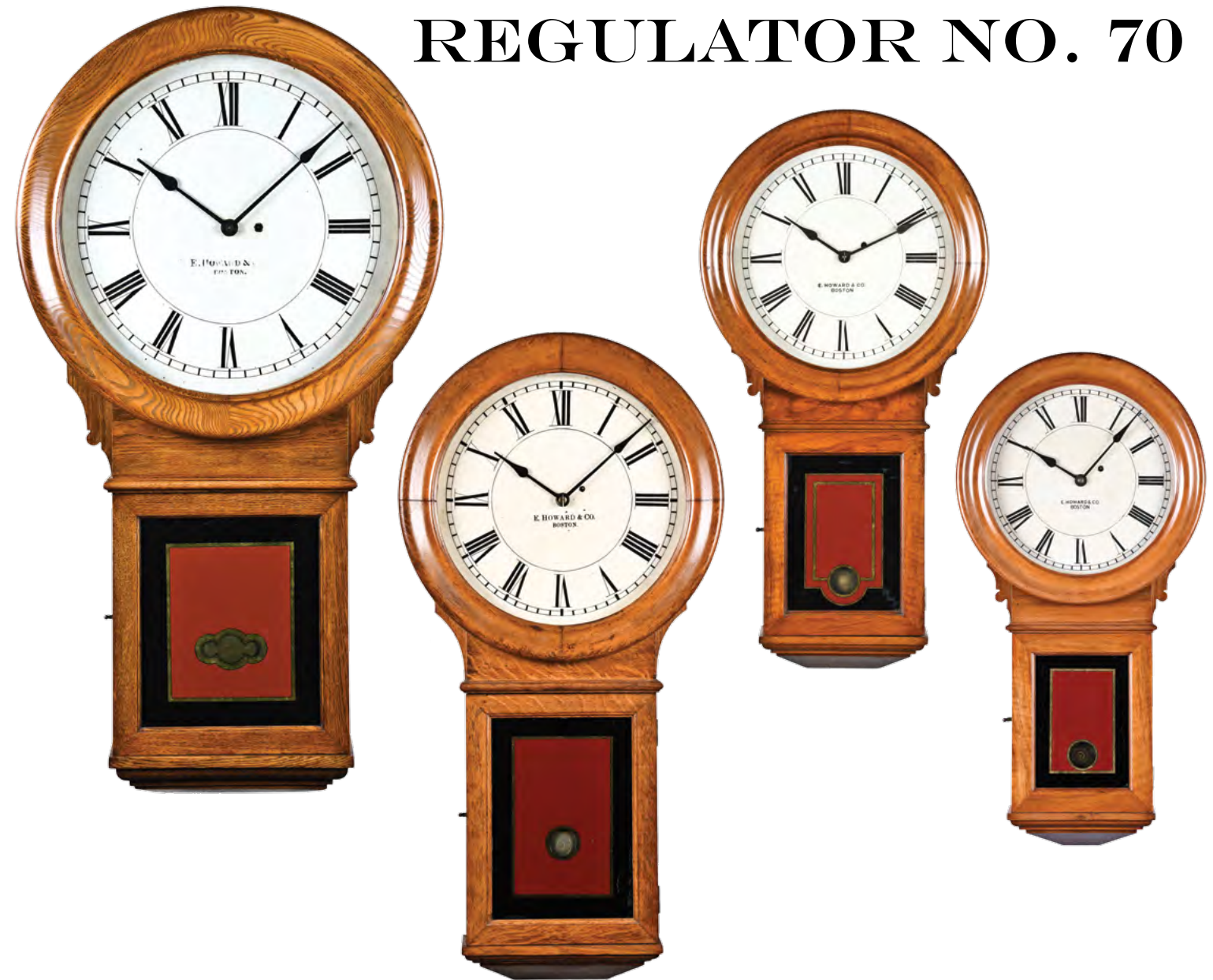
230 E. Howard & Co., Boston, Mass., "No. 70-20 Regulator" hanging clock, 8 day, time only, weight driven movement in a large oak case with 20in painted sheet metal dial and reverse painted lower tablet $8000-$10000 Circa 1900 48.75in x 25.5in x 6.75in